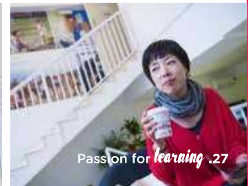
Passion for learning .27