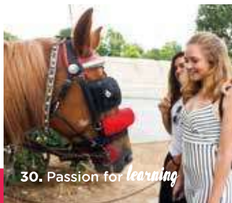
30. Passion for learning