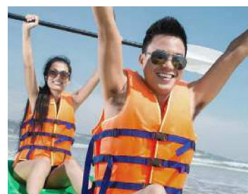
SPORTS & ACTIVITIES