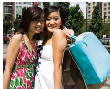
SHOPPING & DINING