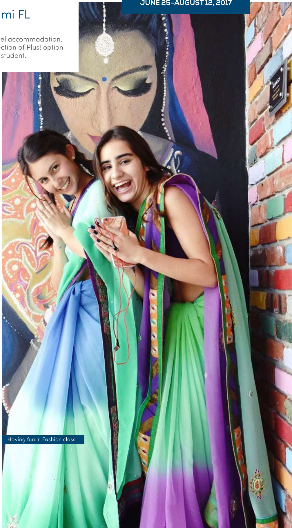
Having fun in Fashion class