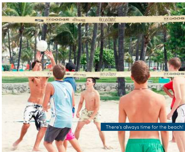
There's always time for the beach!