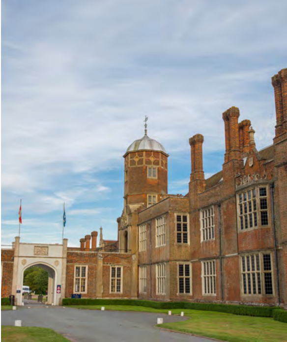
Cobham Hall Kent, UK